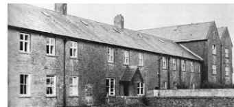
Tuam Mother and Baby Home

The Home for unmarried pregnant women, was run by the Bon Secours order of nuns from 1925 to 1961. This was a time in