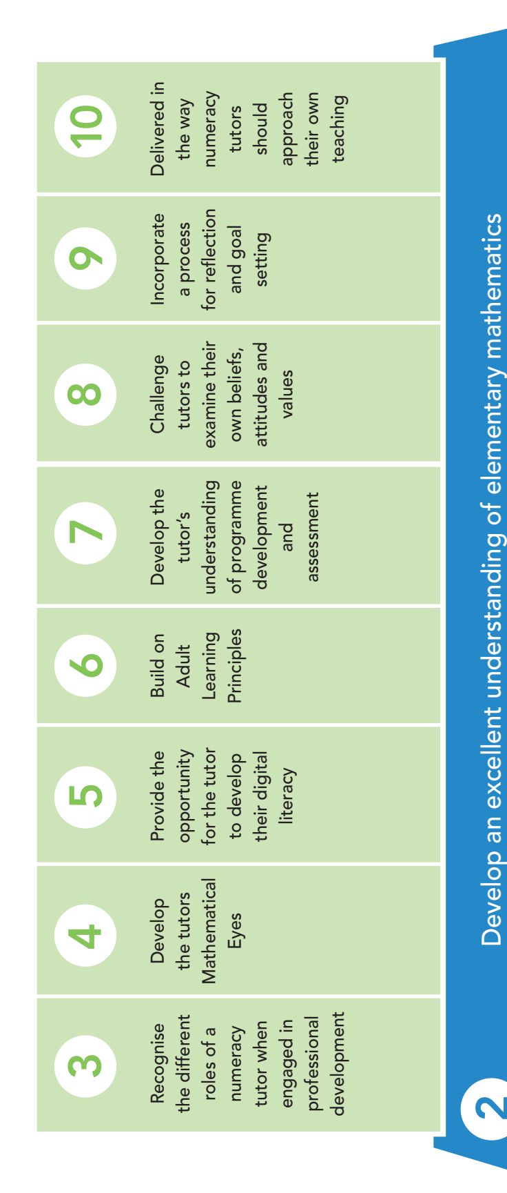
Core Components of Professional Development for Tutors of Adult Numeracy in Further Education in Ireland

Must be underpinned by a broad definition of numeracy (as outlined in PIAAC, 2009)