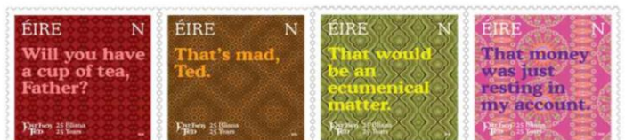
The new Father Ted Stamp Booklet

that people still remember her as Mrs. Doyle and hopes that the new stamps will make people smile.