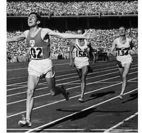
Ronnie Delaney wins gold in 1956

to win a second gold in the 1932 games. Wicklow born Ronnie Delaney won a gold in the 1,500 metres race in 1956 at the Melbourne Olympics. At 86 he is still the only Irish runner to have won a gold Olympic medal.