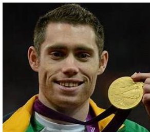
Ellen Keane and Jason Smyth Gold Medallists

Derry man Jason Smyth took gold in the men's 100 metre race. He beat the second fastest runner by just one hundredth of a second. Jason, who is visually impaired, now has six Olympic gold medals for running. He also holds the world record for running the fastest 100 and 200 metres races.