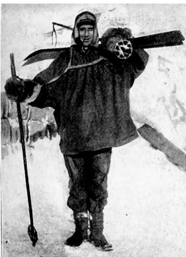
Crean prepares for the trek to the South Pole with Captain Scott in 1911

In 1901 Crean volunteered to be part of an expedition to the South Pole which was led by the famous explorer Captain Robert Scott on board the ship the Discovery. When they got to within 600 miles of the South Pole, the ship got stuck in ice. The crew survived on the ship for two years before they managed to free the ship and return to land.