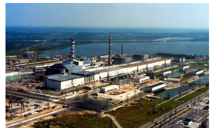
Chernobyl Nuclear Power Plant

Many people died. Many more people became very sick. We do not know how many people got sick and are still getting sick from the gas. It could be many thousands of people.